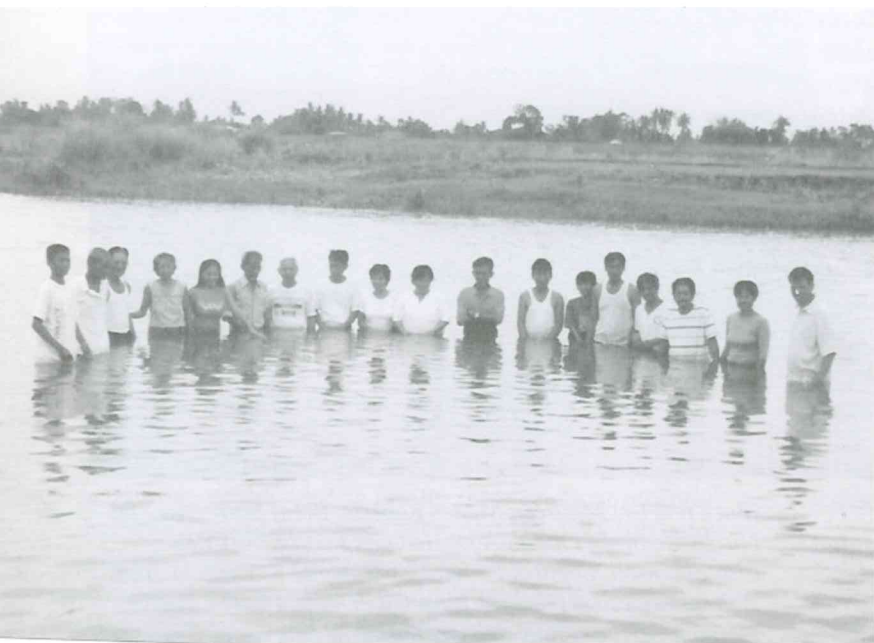
First baptism on June 3, 2007

God is coming soon. It is our responsibility to share the good news to others. Let us use our talents and resources by God's grace in order that the work of God will be brought to a mighty finish.