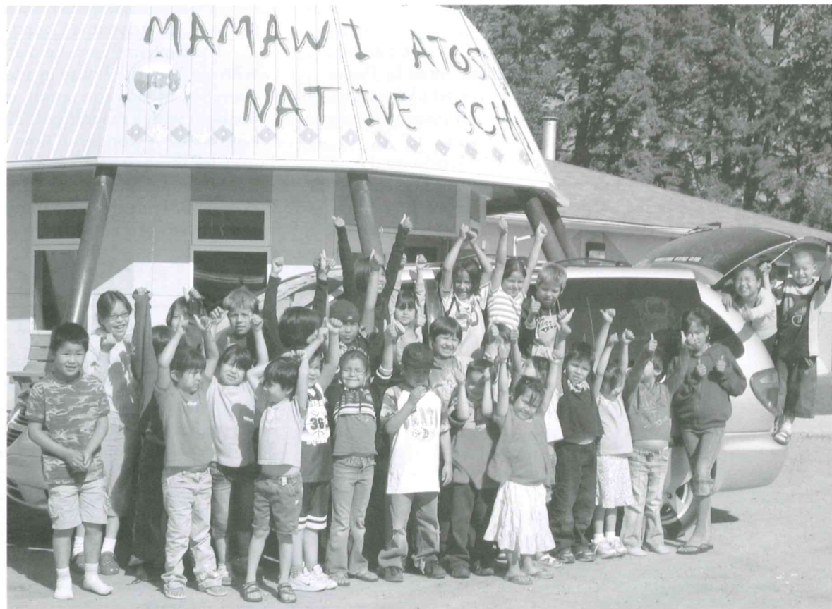
Continued on page 4 The students of Mamawi definitely approve of the new van!