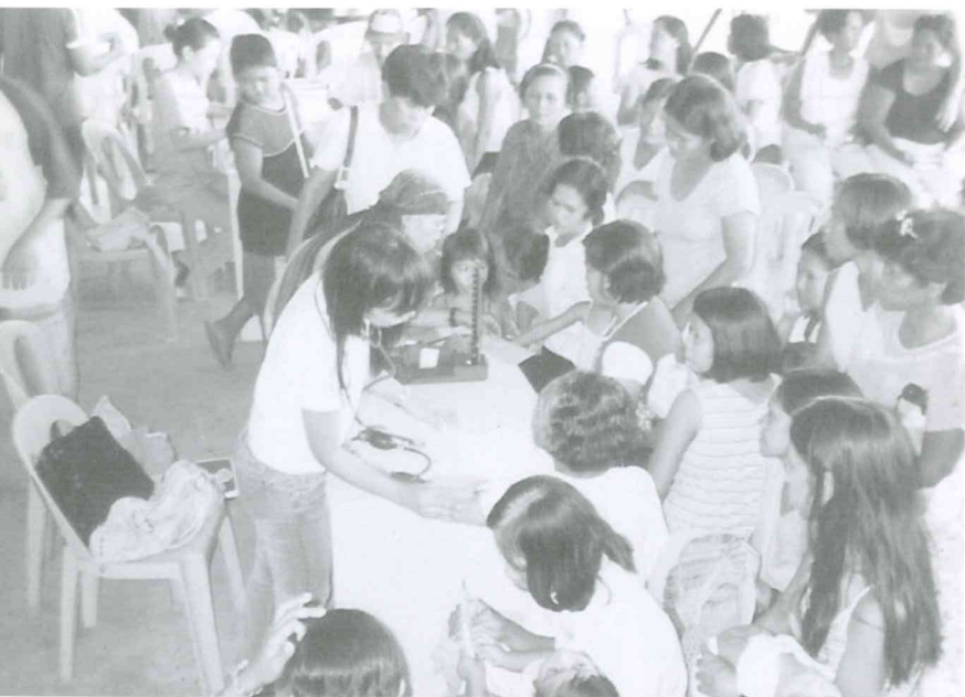
Medical Outreach - checked up, FBS screening, etc.