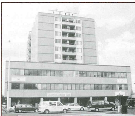
The Royal Alex Place building in Edmonton, where the ADRA Alberta offices are located

Office and seminar space has been provided on the main floor of the Royal Alex Place in Edmonton with no leasing charges! The landlord provided 400 square feet of space for an emergency supplies depot - also no charge! The ten-story building houses the Council of Hospitals, the Alberta association, the Edmonton, the Edmonton, and many other Large signs erected in of the building now let the ADRA Alberta the Adventist Commu- tre is located there. are a witness in the the city, given that an cars drive past every