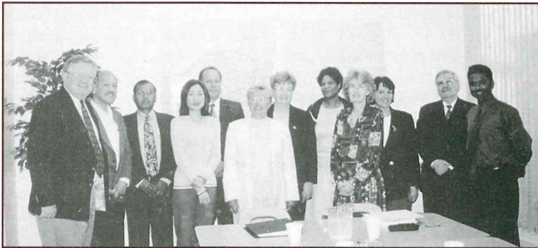
A partial group of the professionals and community leaders that comprise the Board of Directors

A lberta Conference administration had a dream to establish a strong community services program in the province with centres in major cities to bring relief from human suffering and to be a means for the local churches to make a meaningful contribution to society by bringing health and healing to the local community. The centre—the one in the capital city—is no longer a dream. It's already a reality!