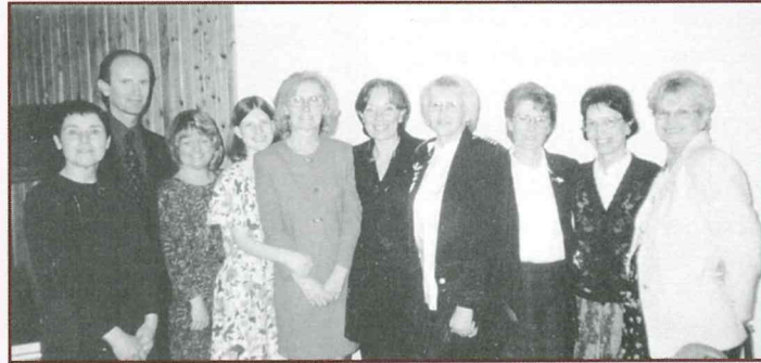
Deaf Fellowship Sabbath for the deaf in the Alberta meeting at the Edmonton South church in April 1999. The deaf get together monthly and rotate to meet in each of their home churches around Alberta. They have done this now since 1987